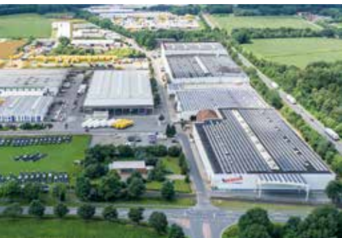
Production facility Herzlake (Germany)