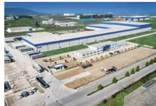
Production facility Tire (Turkey)