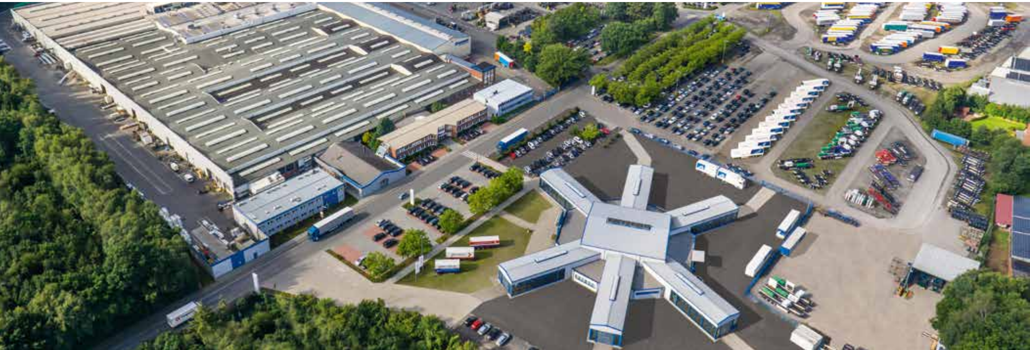
Production facility Werlte (Germany)