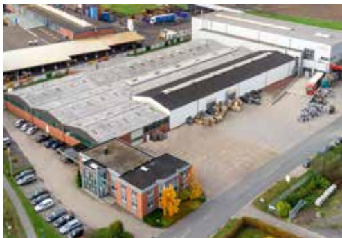
Production facility Dinklage (Germany)