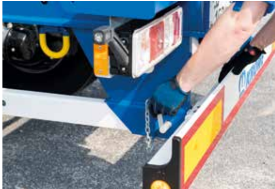
Extendable under-run bumper for 45' containers