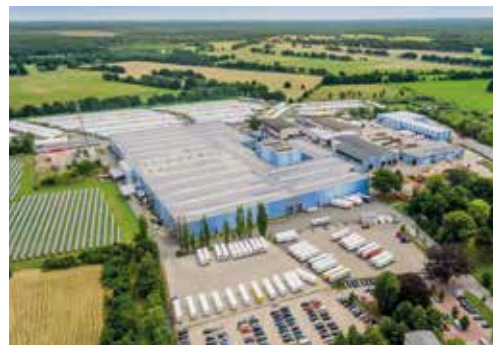
Production facility Lübtheen (Germany)