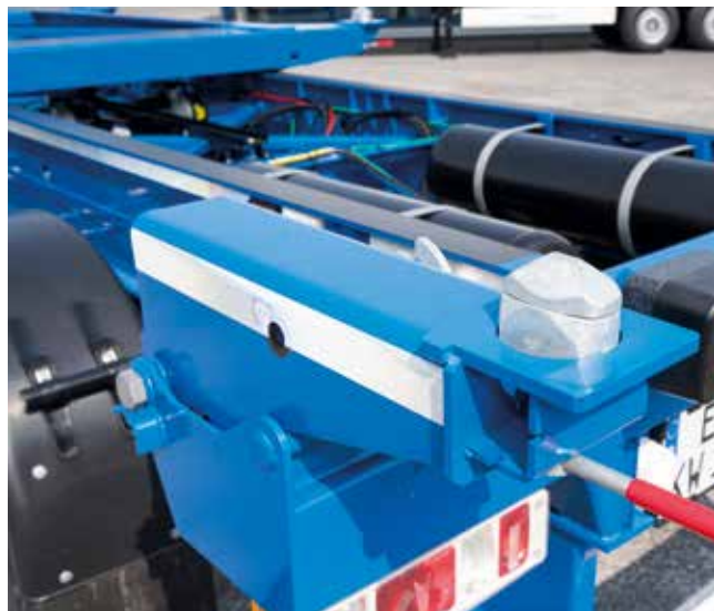
Fold-away twistlock mountings